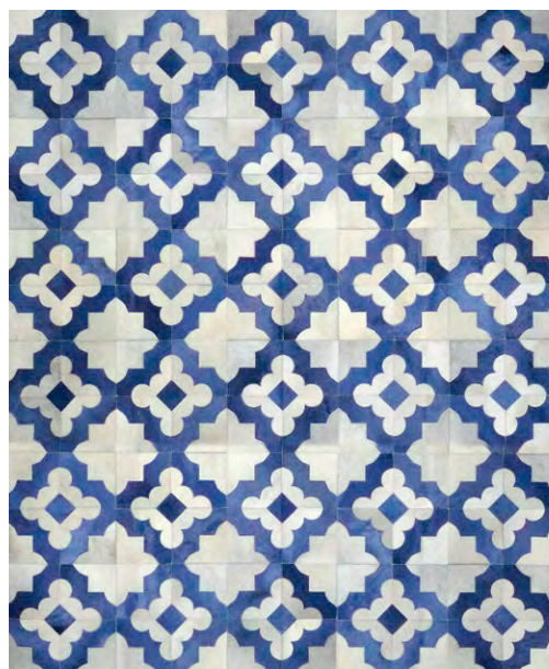
Hyde, Marque 02, Mansour Modern mansourmodern.com