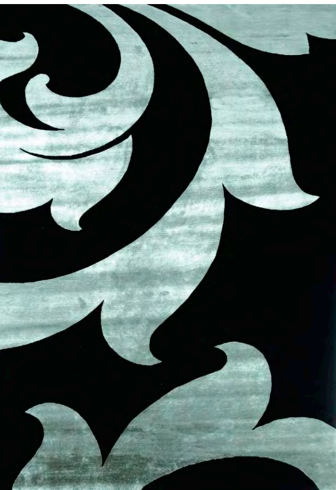
Whimsy, Delos Rugs ~ delosrugs.com