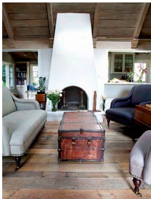
RIGHT: Timeworn Oak Planks, The American Barn Collection