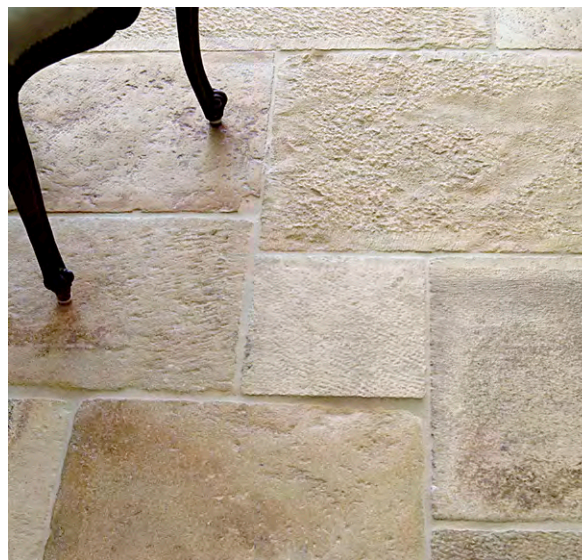
LEFT & ABOVE: Dalle de France, Exquisite Surfaces xsurfaces.com

Stone flooring has always been and will always be in style, just ask the Romans. Here we have Dalle de France , hand-crafted to resemble centuries old chateaux floors. We chose this Antique Limestone from Exquisite Surfaces for its rustic and timeless charm but also its versatility. This look compliments both modern and classic design tones and can transition from indoors to out.